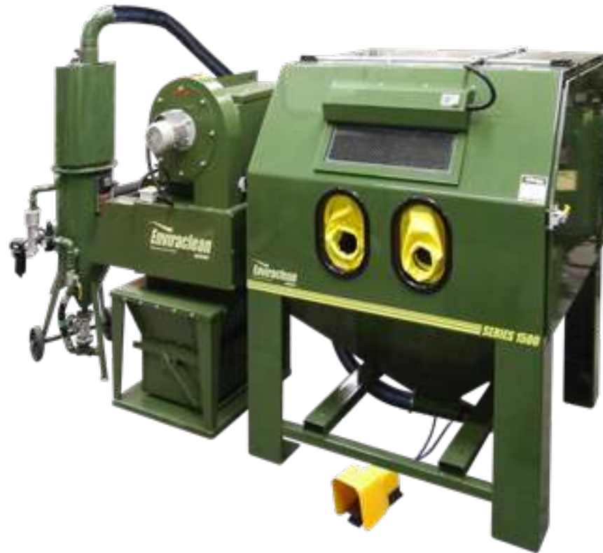
Pressure Cabinet; Dust Collector; Regrader & Blast Machine

Pressure feed machines are commonly used in high production environments or on applications such as alloy wheel refurbishment and cleaning heavy castings.