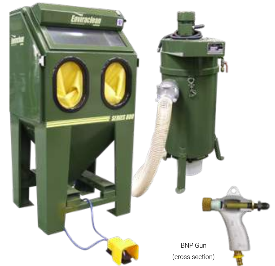
BNP Gun (cross section)

Suction systems are generally lower in capital cost than a pressure cabinet and use less compressed air, making them an attractive proposition for smaller workshops or lower production environments.