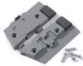
Visor Mount Kit (includes 4pcs FS-40 nuts and 4pcs FS46 screws) NV3-727/8