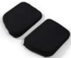
Side Padding Foam and Covers (available in 5mm, 10mm, 15mm and 20mm) NV3-732 (A5, A10, A15 and A20)