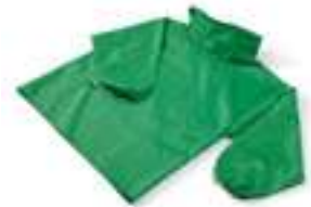
Blast Jacket Size XL (includes inner Bib NV2012) NV3-754