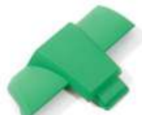
Hing Lock NV3-727-2