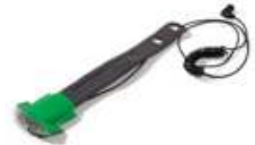
L4 Light and Mount Kit 09-512