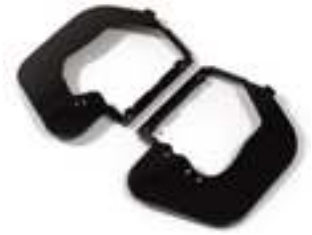
Side Padding Frames (left and right) NV3-731