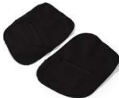
Side Padding Covers (for Nova 3 Talk, 5 pairs) NV3-733TK