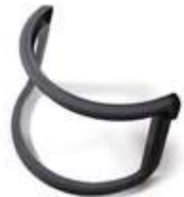
Inner Gasket NV3-721