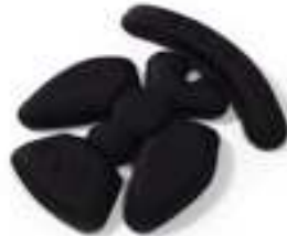
Head Liner Foam Padding NV3-735