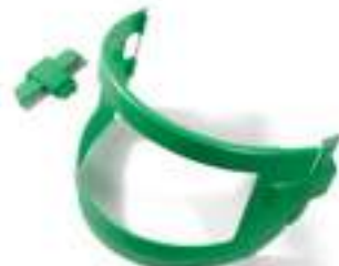
Visor Kit (includes hinge and latch) NV3-726