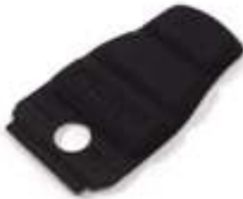
Neck Pad NV3-735-1