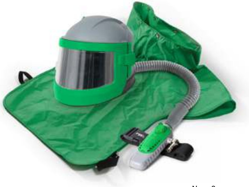
Nova 3 Nylon Respirator Cape C40 Climate Control Device SAR Breathing Tube NV3-705-50