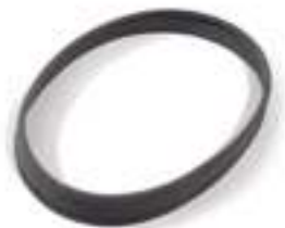
Cape Cover Band NV3-759