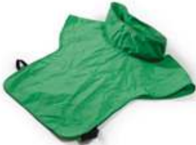
Nylon Respirator Cape (includes inner Bib NV2012) NV3-750