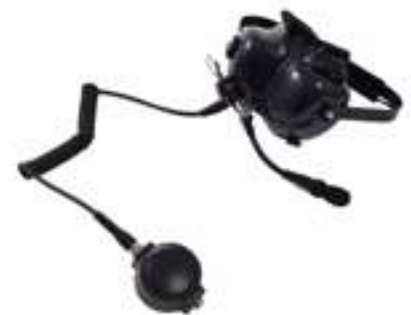
R-Tex High Noise Headset (includes PTT, radio not supplied) 09-916