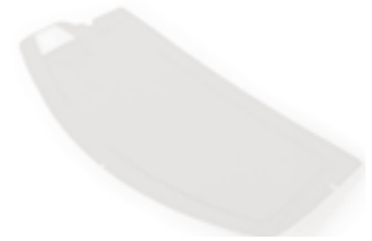
Tear-off Lens (pk50) NV3-725