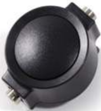
Push to Talk Button 09-913