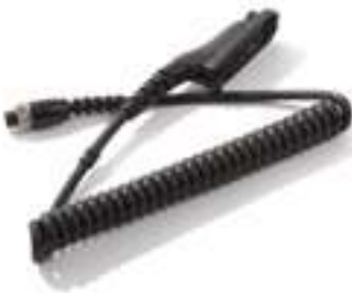
Motorola Connection Cable (multi-pin) 09-932