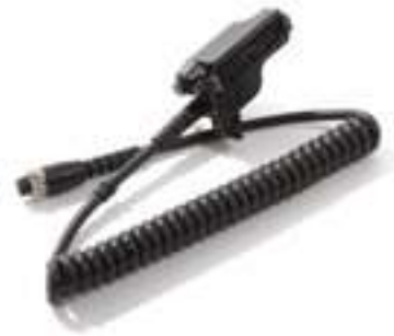
Motorola Connection Cable (multi-pin) 09-934