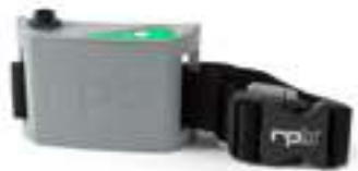
Battery Pack 09-532-2