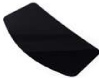
Tinted Inner Lens (pk10) NV3-722-T