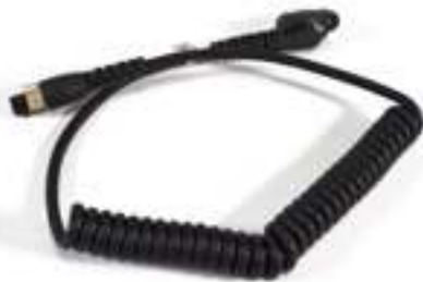
Cable for VX-261 09-938