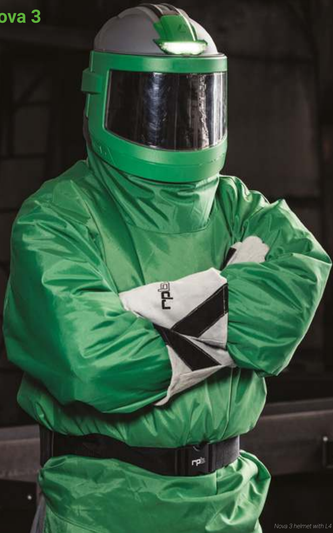
Nova 3 helmet with L4 light and cape