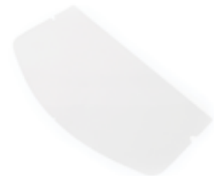
Outer Lens (pk50) NV3-724