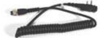
Cable for Apex Icom IC-F4002 09-939