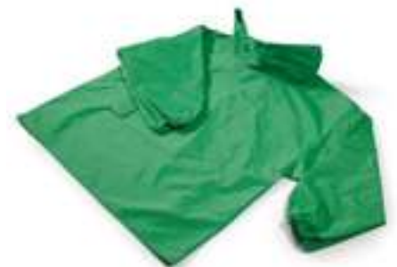
Blast Jacket Size XXL (includes inner Bib NV2012) NV3-755