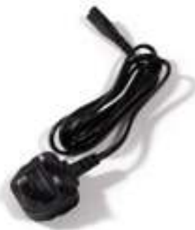
Power Cable 09-021-UK