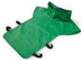
Extra Length Nylon Respirator Cape (includes inner Bib NV2012) NV3-751