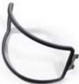
Inner Lens Frame NV3-723