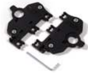
Padding Connectors (left and right) NV3-730