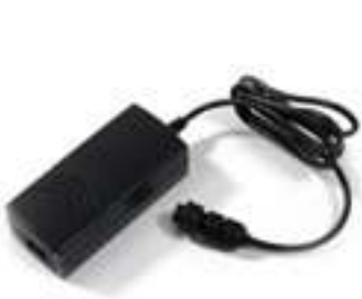
Battery Charger (power cable not included) 09-525