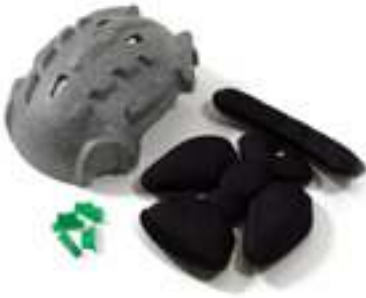
Head Liner Kit (includes NV3-734-1) NV3-734