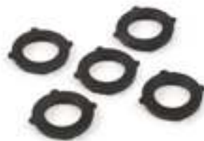
SAR Breathing Tube Hose Washer (pk 5) NV2023