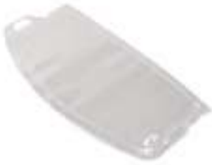
Cassette Lens System (pk 20, 5 Tear-off and 1 Outer Lens fused together) NV3-7454