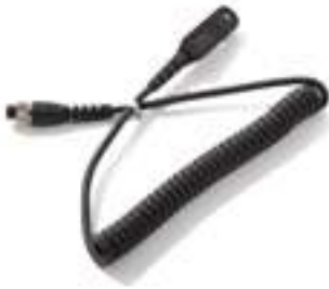
Motorola Connection Cable (multi-pin) 09-931