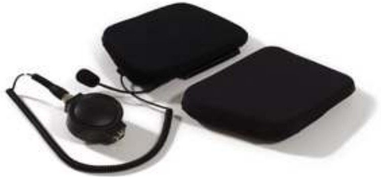
Nova 3 Talk Upgrade Kit (cable not included, radio not supplied) 09-903

It comprises of a push to talk, noise cancelling microphone. This allows the operator to be able to communicate in loud and remote locations.