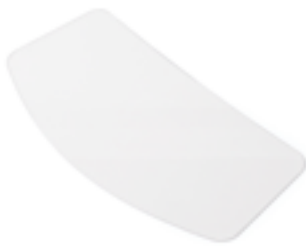
Inner Lens (pk10) NV3-722