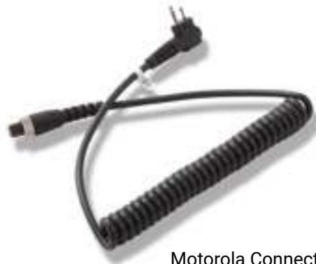
Motorola Connection Cable (two-pin) 09-930