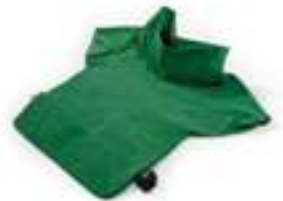
Leather Respirator Cape (includes inner Bib NV2012) NV3-752