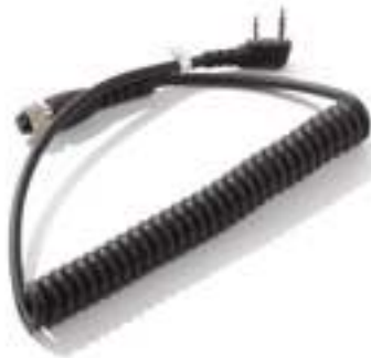
Kenwood Connection Cable (two-pin) 09-933