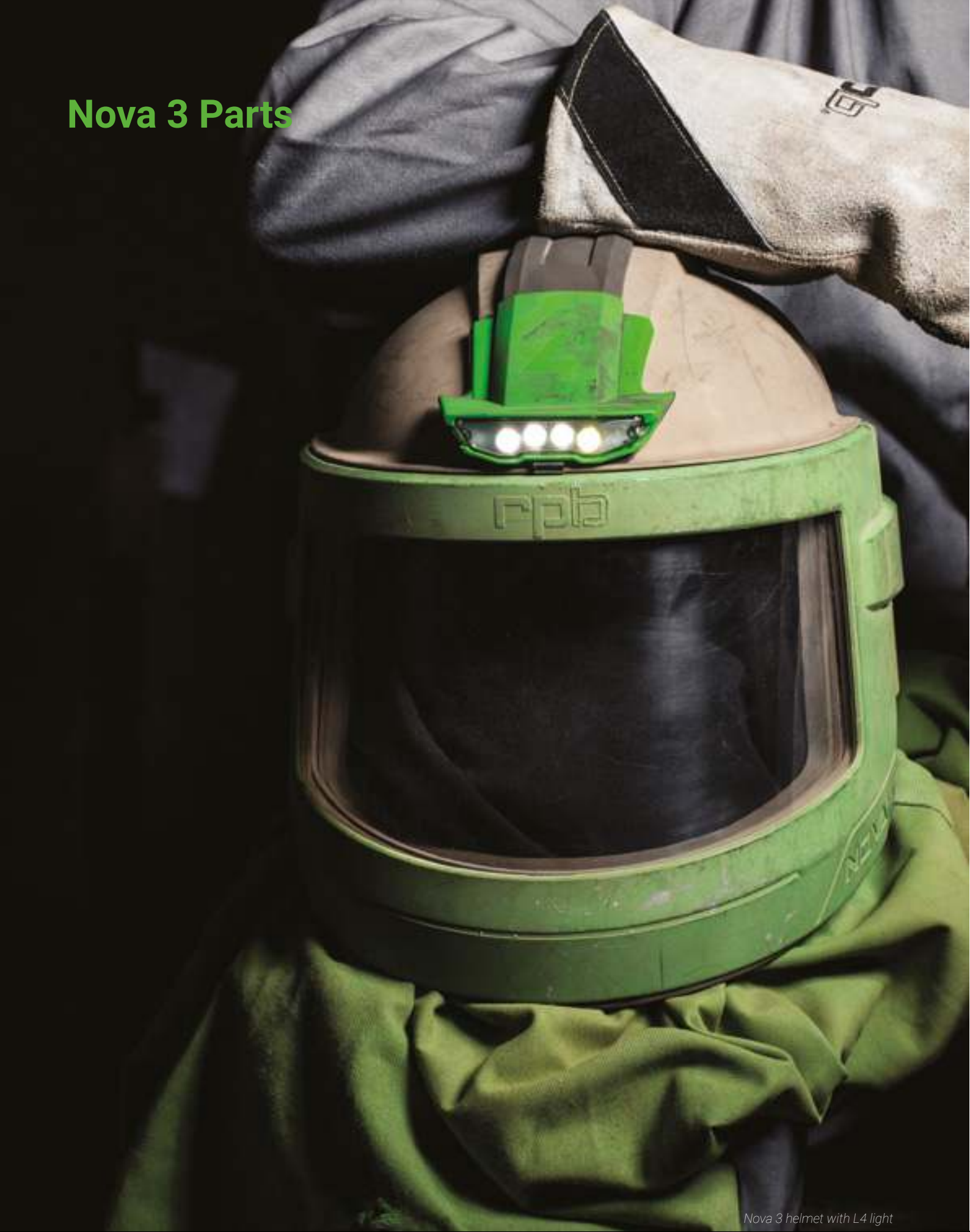
Nova 3 helmet with L4 light