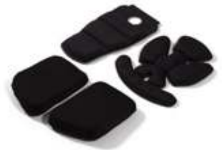
Hygiene Kit (available in 5mm, 10mm, 15mm and 20mm) NV3-736 (A5, A10, A15 and A20)