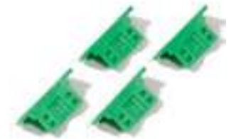
Head Liner Clips (pk4) NV3-734-1