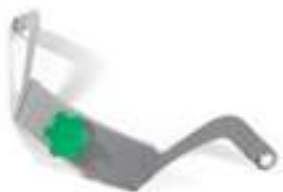
Adjustable Head Support 07-900