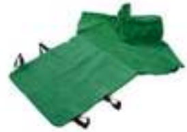
Extra Length Leather Respirator Cape (includes inner Bib NV2012) NV3-753-HD