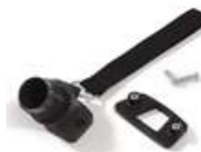
Air Inlet Kit NV3-729