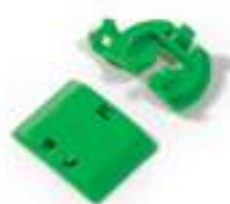
Mounting Clip 09-520