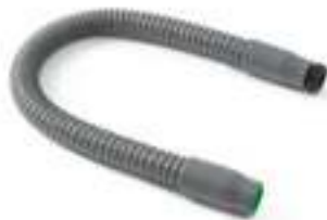
Supplied Air Breathing Tube NV2021B