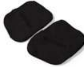
Side Padding Covers (5 pairs) NV3-733