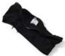
Inner Bib NV2012