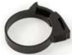
Cable and Hose Clamp 07-122